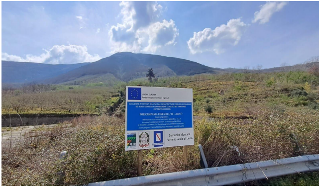
FOTO PRE INTERVENTO